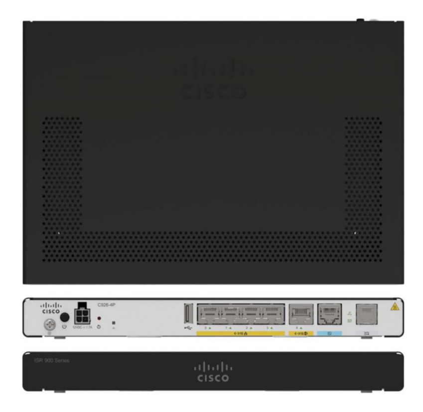
Figure 2. C926-4P ISR Front, Back, and Top Views