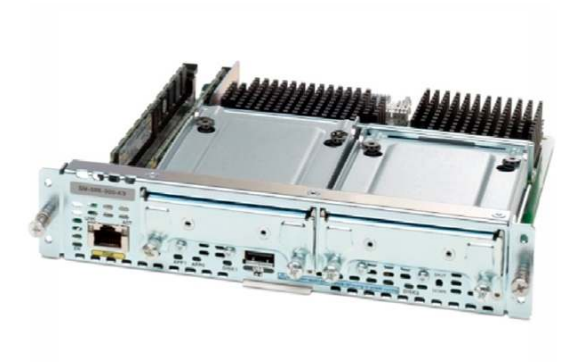
Figure 1. Cisco SRE Module

Cisco WAAS is a comprehensive WAN optimization and application acceleration solution that is a crucial component of Cisco Borderless Networks and data center and virtualization architectures. It accelerates applications and data over the WAN, optimizes bandwidth, empowers cloud computing, and provides local hosting of branch IT services, all with industry-leading network integration.